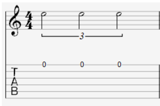
Diagram 1: Half-note Triplets

This results in a “3 over 4” type of polyrhythm. The easiest way to feel this rhythm is to first play or count 8 th note triplets. There are three 8 th -note triplets per beat as per Diagram 2.