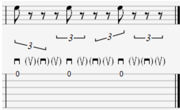
Diagram 5: Using Pick Direction to Feel Half-note Triplets

This article is not suggesting that alternate picking is always the best way to pick. Economy picking or sweep picking may be more efficient and better suit your style or the song's mood. Alternate picking, however, can be a great tool whereby to feel the rhythm in question better in your body. Once you can feel the rhythm in your body, you can adjust your technique to suit the particular passage or lick you are playing, but you must feel it first.