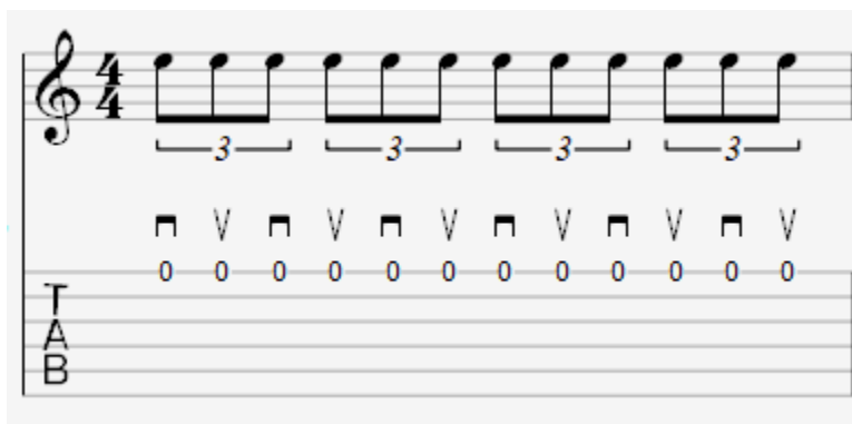
Diagram 2: Eighth-note Triplets

This results in a “3 over 4” type of polyrhythm. The easiest way to feel this rhythm is to first play or count 8 th note triplets. There are three 8 th -note triplets per beat as per Diagram 2.